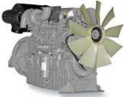
PERKINS Engine 2806A-E18TAG1A