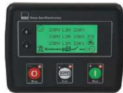
DSE4510 MKII AUTO START & AUTO MAINS FAILURE CONTROL