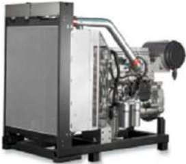
PERKINS Engine 2506A-E15TAG1