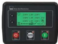
DSE4510 MKII AUTO START & AUTO MAINS FAILURE CONTROL