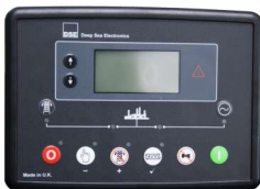
DSE7320 MKII AUTO START & AUTO MAINS FAILURE CONTROL