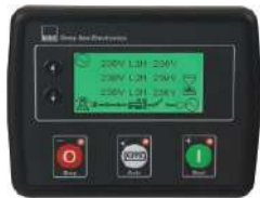
DSE4510 MKII AUTO START & AUTO MAINS FAILURE CONTROL