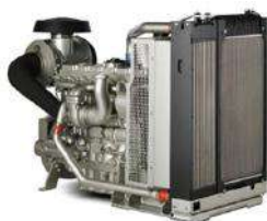
PERKINS Engine 1206A-E70TTAG3