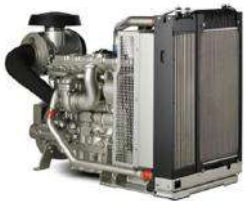
PERKINS Engine 1206A-E88TAG3