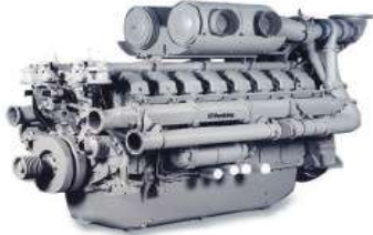
PERKINS Engine 4016-61TRG3