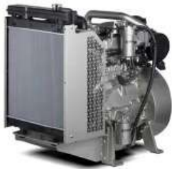
PERKINS Engine 1106A-70TAG3