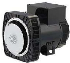
Leroy somer TAL044M