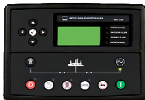
DSE-7320 Remote Control Panel