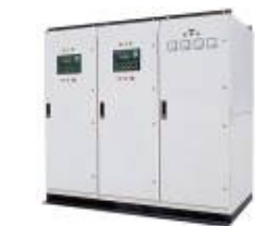
DSE-550 Parallel Control Panel system