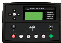
DSE-7320 Remote Control Panel