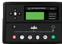
DSE7320 Remote Control Panel