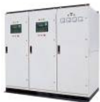
DSE-550 Parallel Control Panel system